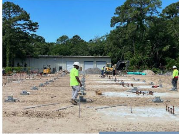
“Upper” Slab Grading