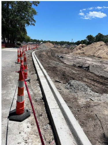
Entrance Lane Curb Installation