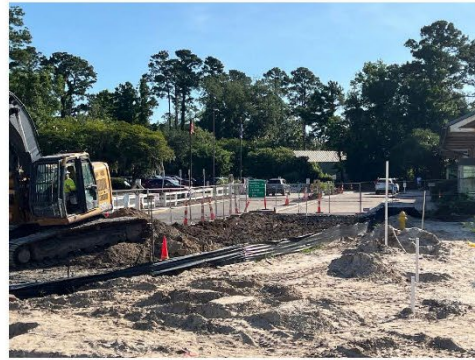
Arrival Lane Demo