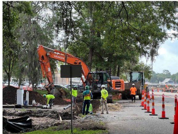
Entrance Lane Underground Work