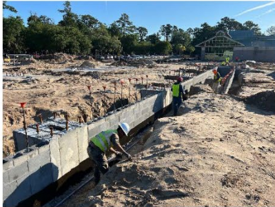
Surface/Slab wall, pre-Slab Pour